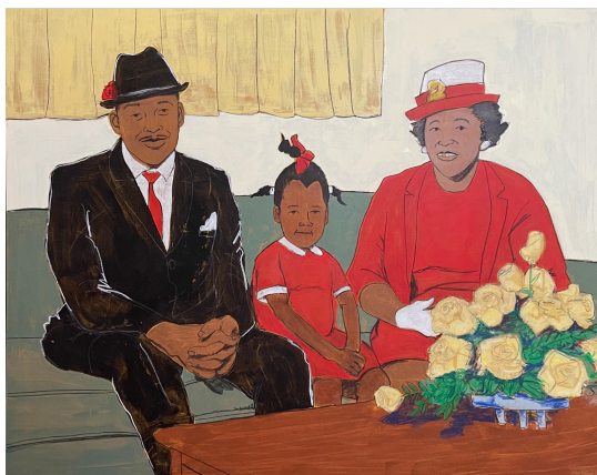
Early Sunday Morning